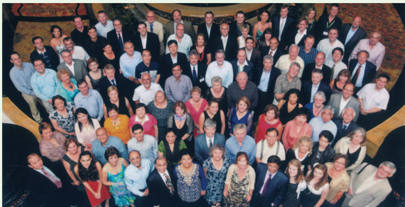
Delegates prior to the Gala Dinner