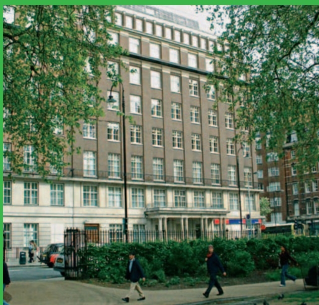
DFK INTERNATIONAL EXECUTIVE OFFICE RUSSELL SQUARE, LONDON, UK