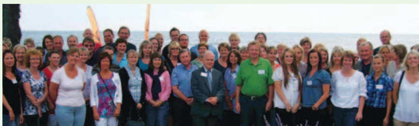
Delegates at DFK Sweden National Group Conference

The Ystad Saltsjöbad Hotel in southern Sweden was the venue for a very successful DFK Sweden national group conference in August 2009. Unusually, the group invites all staff to the conference and as a result there were over 60 attendees. The programme was the traditional mix of high quality business sessions and plenty of opportunity to develop friendships and business.