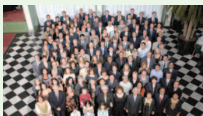
Group photo of attendees at the Amsterdam Conference taken prior to the Gala Dinner