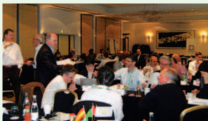
Delegates attending "Marketing in a Recession" Workshop

The programme was based upon workshops for delegates on topics relevant either to the development of services for clients or practice management issues. Delegates enjoyed presentations from two excellent guest speakers.