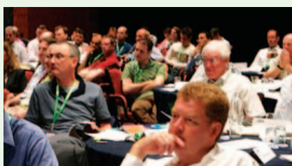
Delegates at the DFK International Conference in Amsterdam

Contrary to all expectations, members defied the credit crunch by attending the 2009 DFK International Conference in Amsterdam in record numbers. Over 200 members and their partners enjoyed making new and seeing old friends and exploring the sights of a wonderful old European city. The business sessions, workshop and social programme proved extremely successful. A particular highlight of the conference was the quality of the two external speakers.