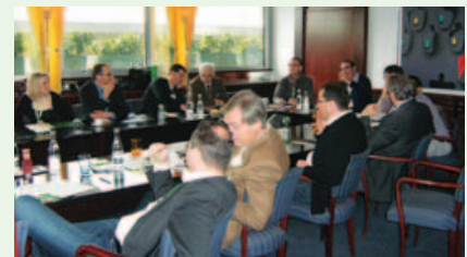
Delegates attending "Carbon Management" Workshop

Thanks go to our hosts, Odicéo for helping to organise the programme and for ensuring that attendees were able to enjoy the superb restaurants for which the city is so famous. Those who attended the group dinner at L'Abbaye de Collonges will doubtless never forget the gastronomic offering in the unique setting of an enormous mechanical pipe organ! The city certainly lived up to its reputation.