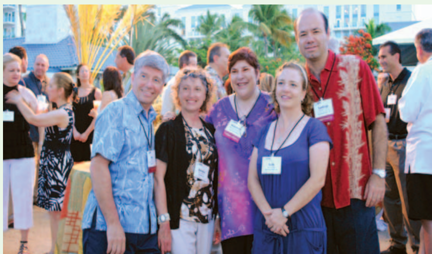
North American attendees enjoying one of the social events