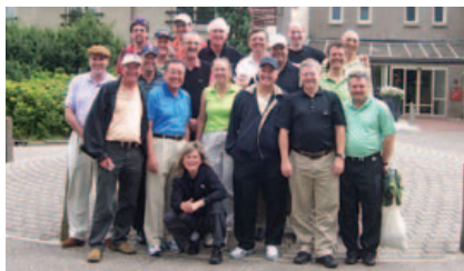
Participants in the 2009 challenge, which was held in Amsterdam.

The challenge is modelled on the Ryder Cup, and typically involves the USA and others competing against Europe and others. The exception was in 2008 when the annual conference was held in Sydney, Australia – in that year the Australians took on the rest of the world!