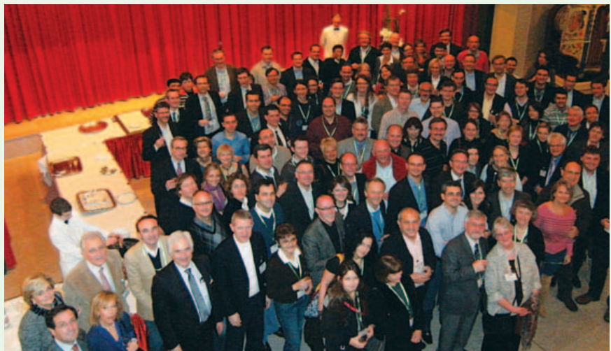
Attendees of the conference enjoying a Champagne reception hosted by the local member firm of Odicéo