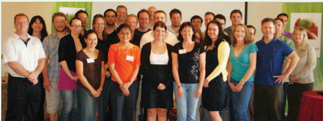
Delegates at DFK ANZ inaugural Managers' Conference

DFK ANZ hosted their inaugural Managers' Conference on 11-13 November 2009 at the Marriott Hotel in Gold Coast, Queensland. The conference was well supported by all member firms of DFK ANZ with 26 attendees. Gooding Pervan, a member firm, provided the guest speakers. The conference focused on soft skills rather than technical skills and the feedback from the attendees was very positive. Everybody agreed this event should become a permanent fixture on the DFK ANZ calendar.